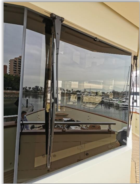
Type C Straight Line Wiper