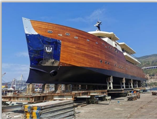
Elegant Wooden Yacht

Our suppliers in China and Hong Kong Foilborne , have provided wipers for this 140ft wooden yacht, built by Hong Kong's traditional local shipyard. The luxury yacht uses five WYNN Type C wipers with Series 1000 control system. In order to maintain the integrity of the ship's appearance, the shipyard cleverly hides the wiper behind the front bulkhead and the wiper arm is sprayed black to go with the overall luxury aesthetic.